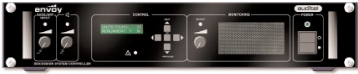
the envoy control unit and power supply

The delegate and chairman units incorporate the same Auditel AM-2 microphone and loudspeakers as the renowned IDN system, which has been spectacularly successful in conference venues and parliament buildings throughout the world. The loudspeaker is automatically muted when the microphone is enabled to prevent feedback. Each unit incorporates a Request button, with multi-colour LED indicating Request and Mic On status. All units also have three voting buttons as standard, incorporating LEDs for confirmation of vote selection.