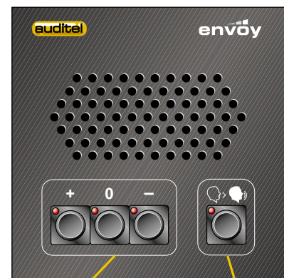
voting and volume set up buttons